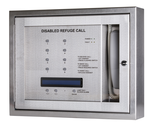
K41208SST (Loop) / K41108SST (Radial)